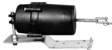
(Clevis and Post Mount Shown)

Models are available with either post or right-angle bracket mounting. Right-angle models are shipped with crank arms for either 1/2" or 3/8" damper shafts. Either style is available with a factory-mounted positive positioner. Actuators with positive positioners include an 8 to 13 psi internal spring and a 5 psi span spring. A 10 psi spring may be ordered separately.