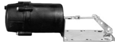
(Crank Arm and Right Angle Mount Shown)